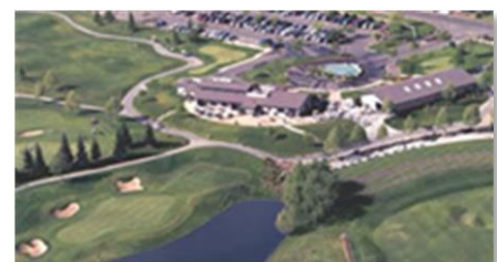
WildHawk Golf Club 7713 Vineyard Road Sacramento, CA 95829