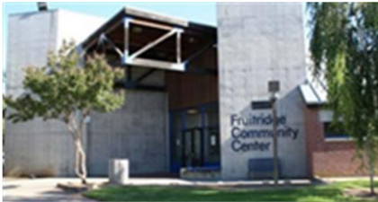
Fruitridge Community Center 4000 Fruitridge Road Sacramento, CA 95820