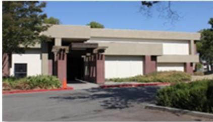
Jose Rizal Community Center 7320 Florin Mall Drive Sacramento, CA 95823