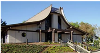
Florin Creek Recreation Center 7460 Persimmon Ave. Sacramento, CA 95823