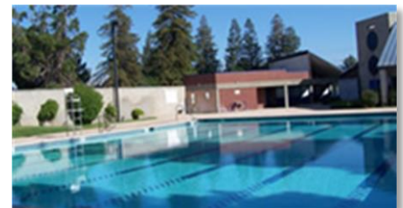
Fruitridge Aquatic Center 4000 Fruitridge Road Sacramento, CA 95820