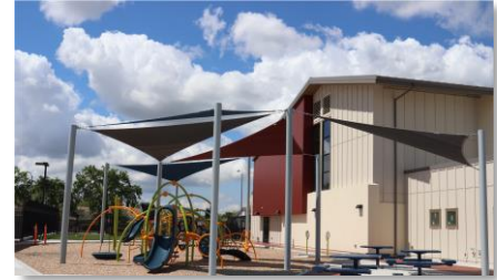
Pat O'Brien Community Center 8025 Waterman Road Sacramento, CA 95829