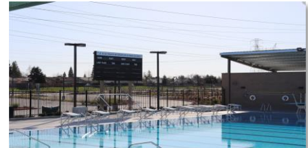
New Aquatic Center 8025 Waterman Road Sacramento, CA 95829