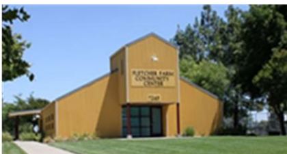
Fletcher Farm Community Center 7245 Fletcher Farm Drive Sacramento, CA 95828