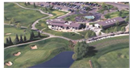
WildHawk Golf Club 7713 Vineyard Road Sacramento, CA 95829