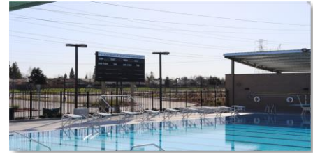
New Aquatic Center 8025 Waterman Road Sacramento, CA 95829