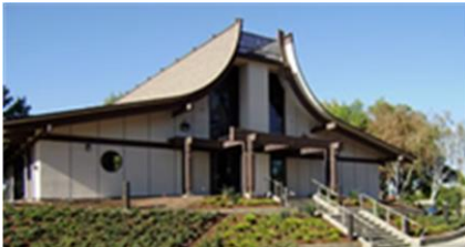
Florin Creek Recreation Center 7460 Persimmon Ave. Sacramento, CA 95823